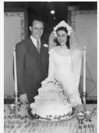
Wedding day November 28, 1946 in Iowa