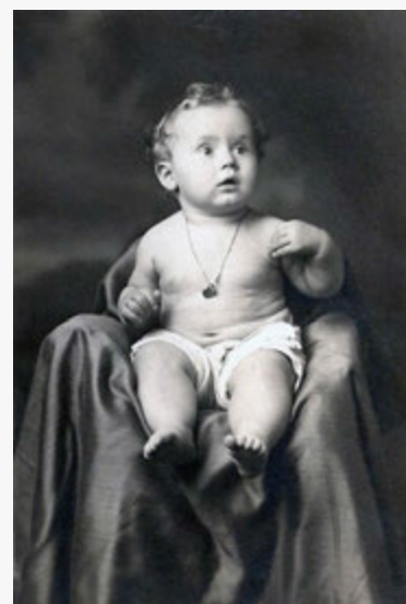
1920 - Age 3