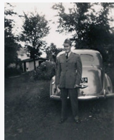
1944 - Age 27