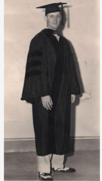
August 1946 - Master of Arts degree graduation from Univ of Iowa