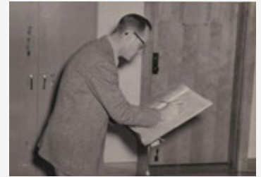
1955 - Studying his score