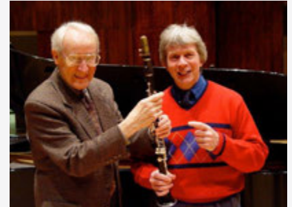
November 11, 2003 - Rehearsal with Richard Stoltzman