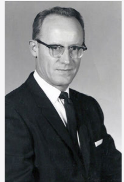
1969 - Age 52